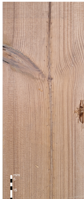
Mechanical defects A grade: Not allowed, except 80 mm ends of board B grade: Allowed, up to 300 mm long, max 0,5 pc. x board length, m