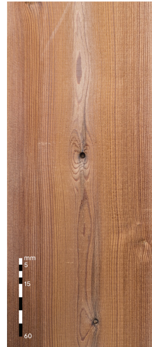
Dead black knots A grade: Allowed, up to 1/10 board width B grade: Allowed, unlimited