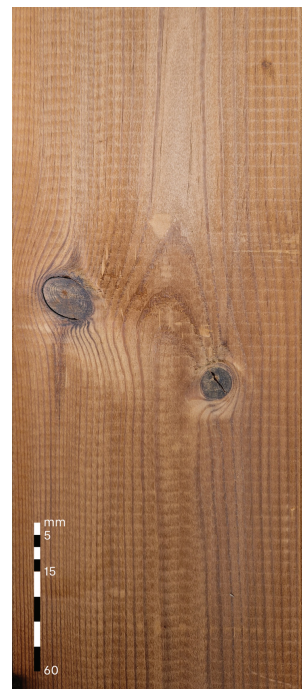
Knots with perimeter crack A grade: Allowed, up to \varnothing 20 mm B grade: Allowed, unlimited