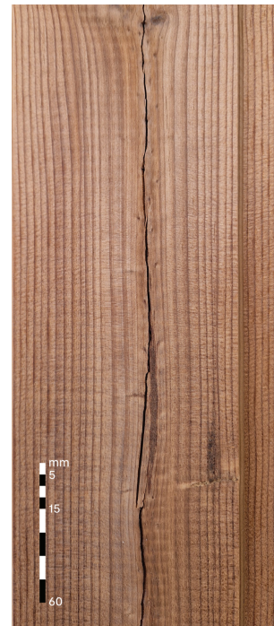
Surface cracks A grade: Allowed, up to 150 mm long B grade: Allowed, unlimited