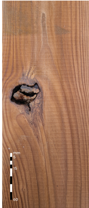
Cracked knots A grade: Allowed, up to 1/10 board width B grade: Allowed, unlimited