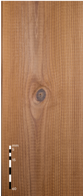
Sound knots A grade: Allowed, unlimited B grade: Allowed, unlimited