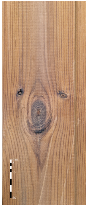
Knot cluster A grade: Allowed, unlimited B grade: Allowed, unlimited