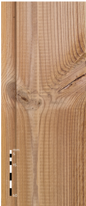
Knot shakes on the edges A grade: Allowed, up to 1/10 board width B grade: Allowed, unlimited