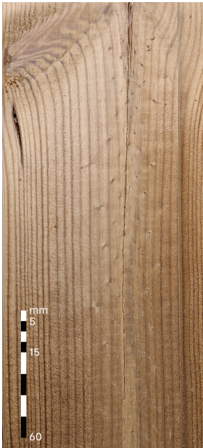
End splits A grade: Allowed, up to board width B grade: Allowed, up to 300 mm