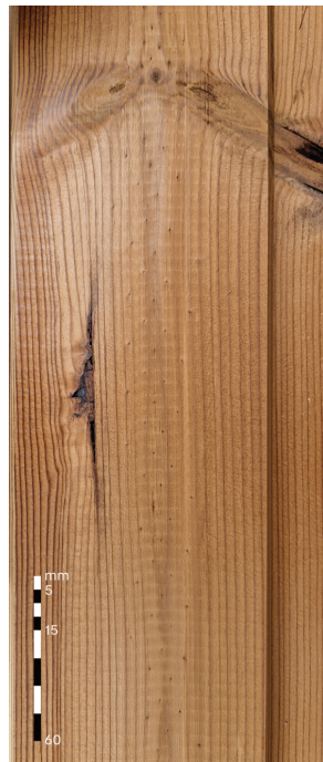
Resin pockets A grade: Allowed, up to 200 mm long B grade: Allowed, unlimited