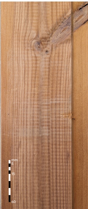
Feed-roller marks (from 0.5 mm deep) A grade: Not allowed B grade: Allowed, unlimited