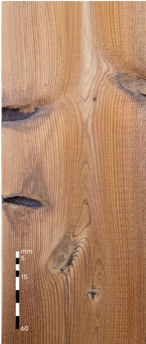
Knotholes on the sides A grade: Allowed, up to 15 mm wide B grade: Allowed, unlimited