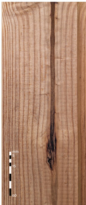
Dead heartwood* A grade: Allowed, unlimited B grade: Allowed, unlimited *it is removed if surface is brushed