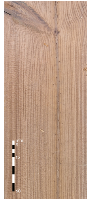
Sound heartwood A grade: Allowed, unlimited B grade: Allowed, unlimited