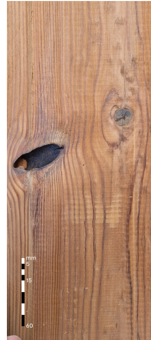
Knotholes A grade: Not allowed B grade: Allowed, up to Ø 20 mm, max 1 pc. x board length, m