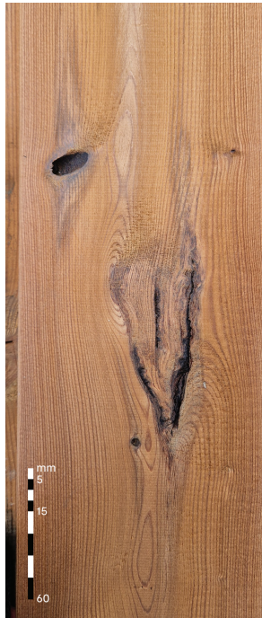
Bark knots A grade: Allowed, up to 1/3 board width B grade: Allowed, unlimited