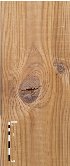
Knot shakes A grade: Allowed, up to 5 mm wide & 50 mm long B grade: Allowed, unlimited