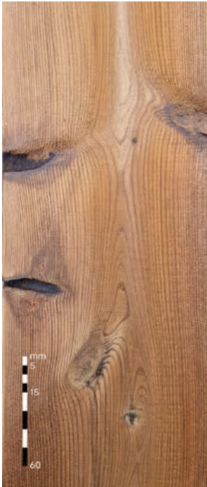
Knotholes on the sides A grade: Allowed, up to 15 mm wide B grade: Allowed, unlimited