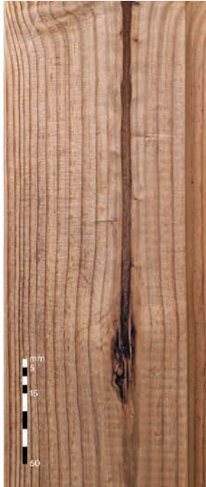
Dead heartwood* A grade: Allowed, unlimited B grade: Allowed, unlimited *it is removed if surface is brushed