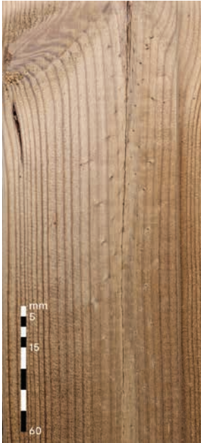
End splits A grade: Allowed, up to board width B grade: Allowed, up to 300 mm