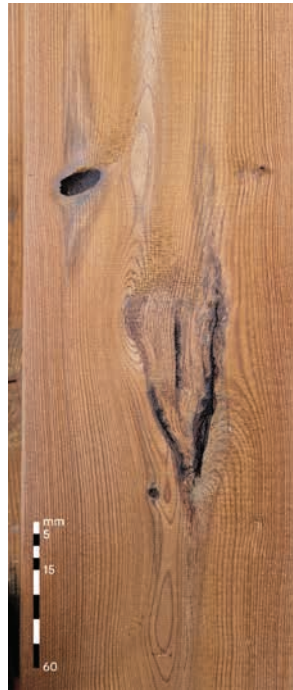
Bark knots A grade: Allowed, up to 1/3 board width B grade: Allowed, unlimited