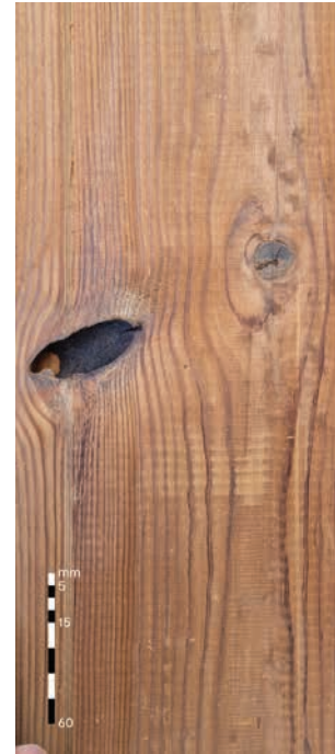
Knotholes A grade: Not allowed B grade: Allowed, up to \varnothing 20 mm, max 1 pc. x board length, m