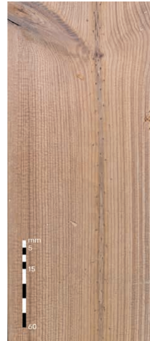
Sound heartwood A grade: Allowed, unlimited B grade: Allowed, unlimited