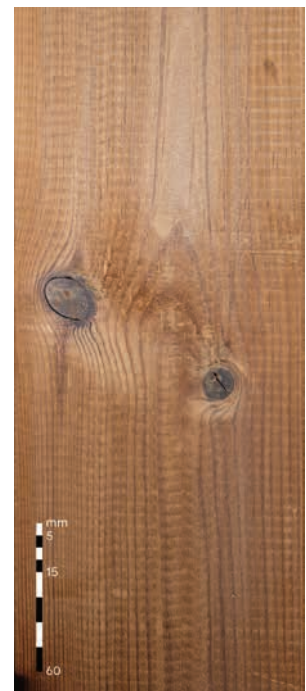
Knots with perimeter crack A grade: Allowed, up to Ø 20 mm B grade: Allowed, unlimited