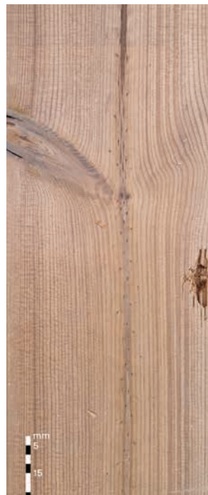
Mechanical defects A grade: Not allowed, except 80 mm ends of board B grade: Allowed, up to 300 mm long, max 0,5 pc. x board length, m