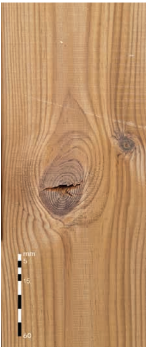
Knot shakes A grade: Allowed, up to 5 mm wide & 50 mm long B grade: Allowed, unlimited