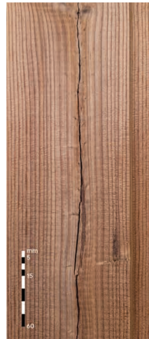
Surface cracks A grade: Allowed, up to 150 mm long B grade: Allowed, unlimited