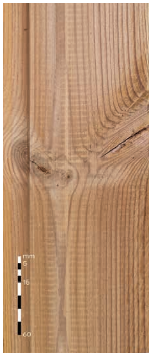
Knot shakes on the edges A grade: Allowed, up to 1/10 board width B grade: Allowed, unlimited