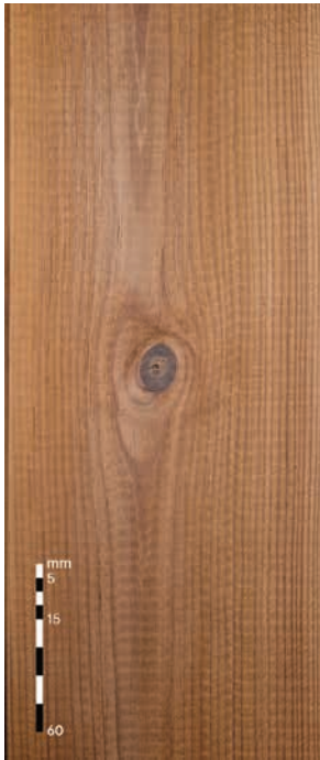
Sound knots A grade: Allowed, unlimited B grade: Allowed, unlimited