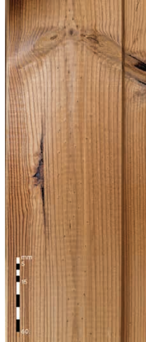
Resin pockets A grade: Allowed, up to 200 mm long B grade: Allowed, unlimited