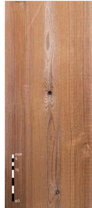
Dead black knots A grade: Allowed, up to 1/10 board width B grade: Allowed, unlimited