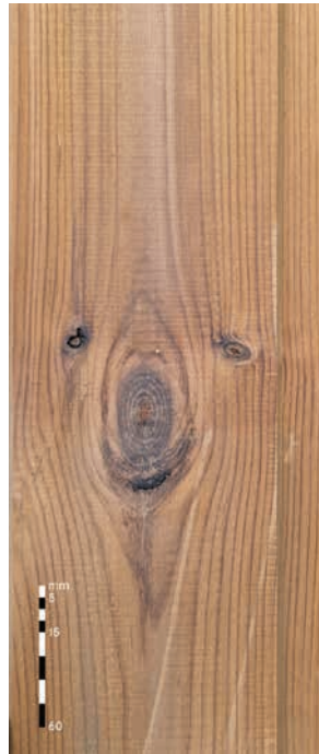
Knot cluster A grade: Allowed, unlimited B grade: Allowed, unlimited