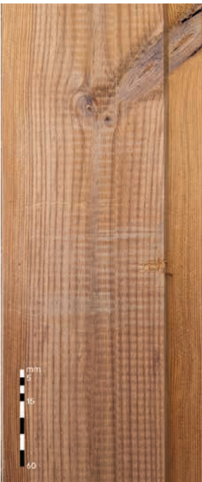
Feed-roller marks (from 0.5 mm deep) A grade: Not allowed B grade: Allowed, unlimited