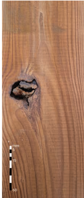
Cracked knots A grade: Allowed, up to 1/10 board width B grade: Allowed, unlimited